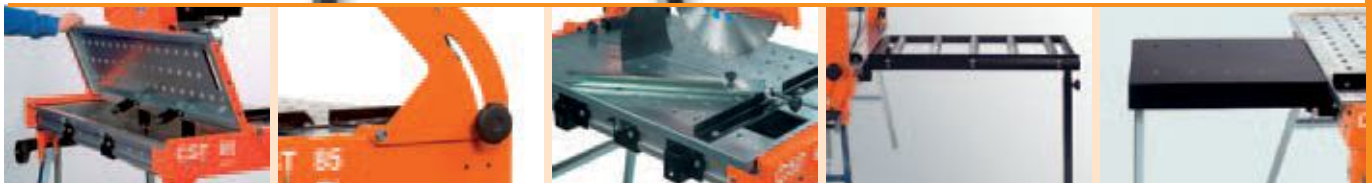
Easy to open table in two parts

Machines delivered without diamond blade.