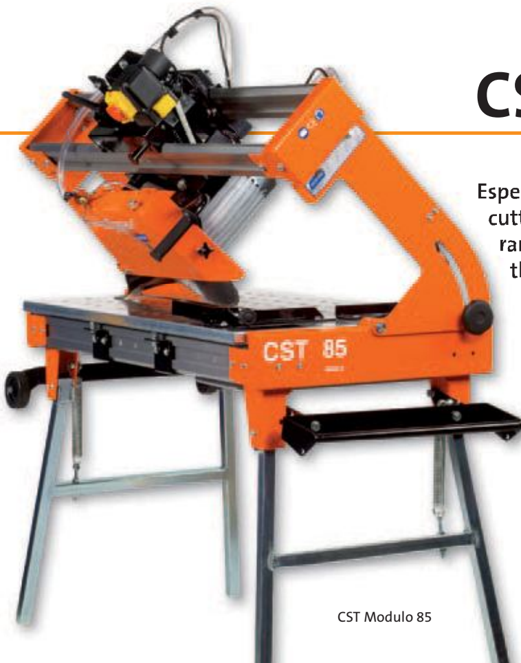
CST Modulo 85

Especially dedicated to the stone cutting, the CLIPPER CST Modulo range of masonry saws is among the most robust machines.